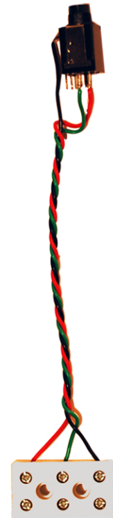
Internal Wiring (See Notes)